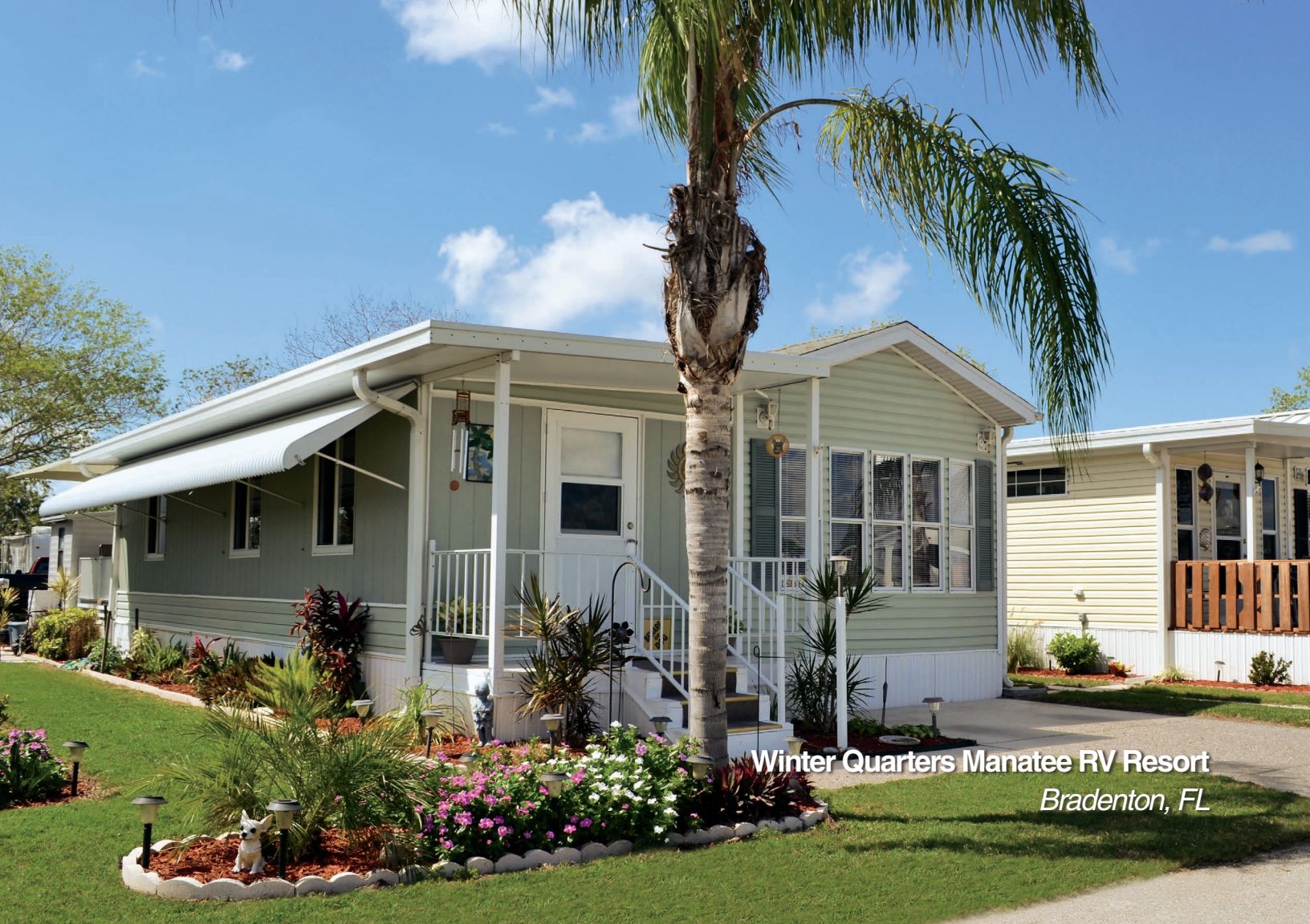
Winter Quarters Manatee RV Resort Bradenton, FL