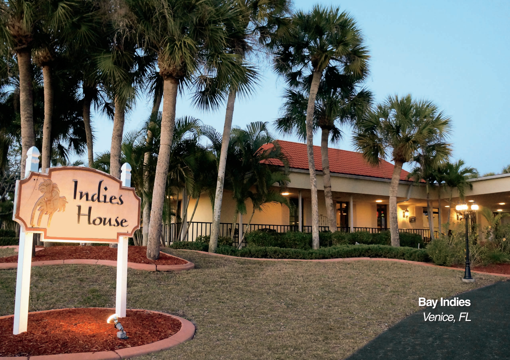
Bay Indies Venice, FL