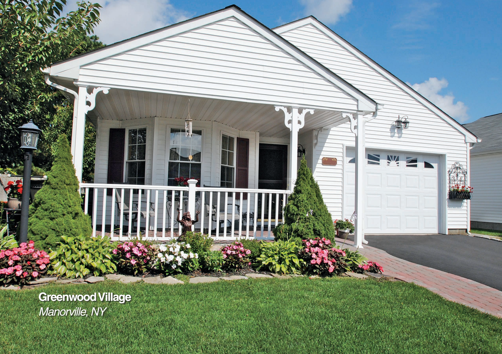
Greenwood Village Manorville, NY