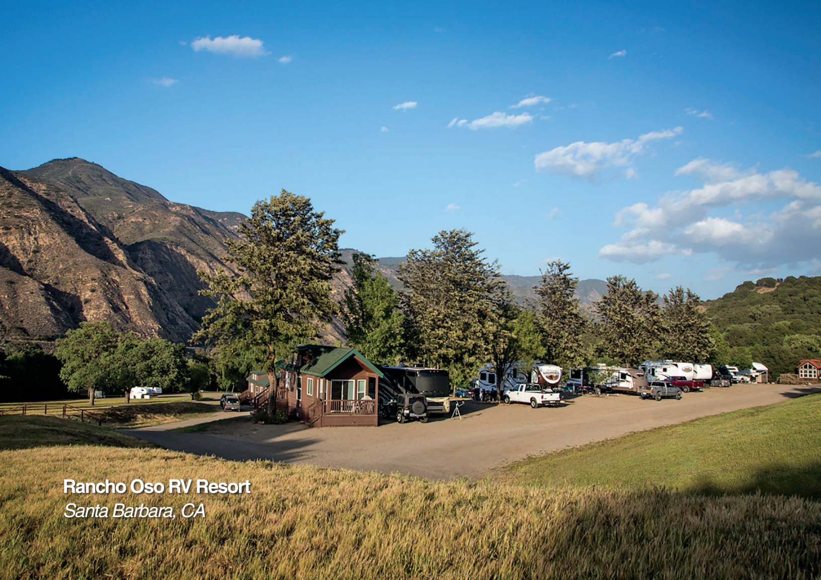
Rancho Oso RV Resort Santa Barbara, CA