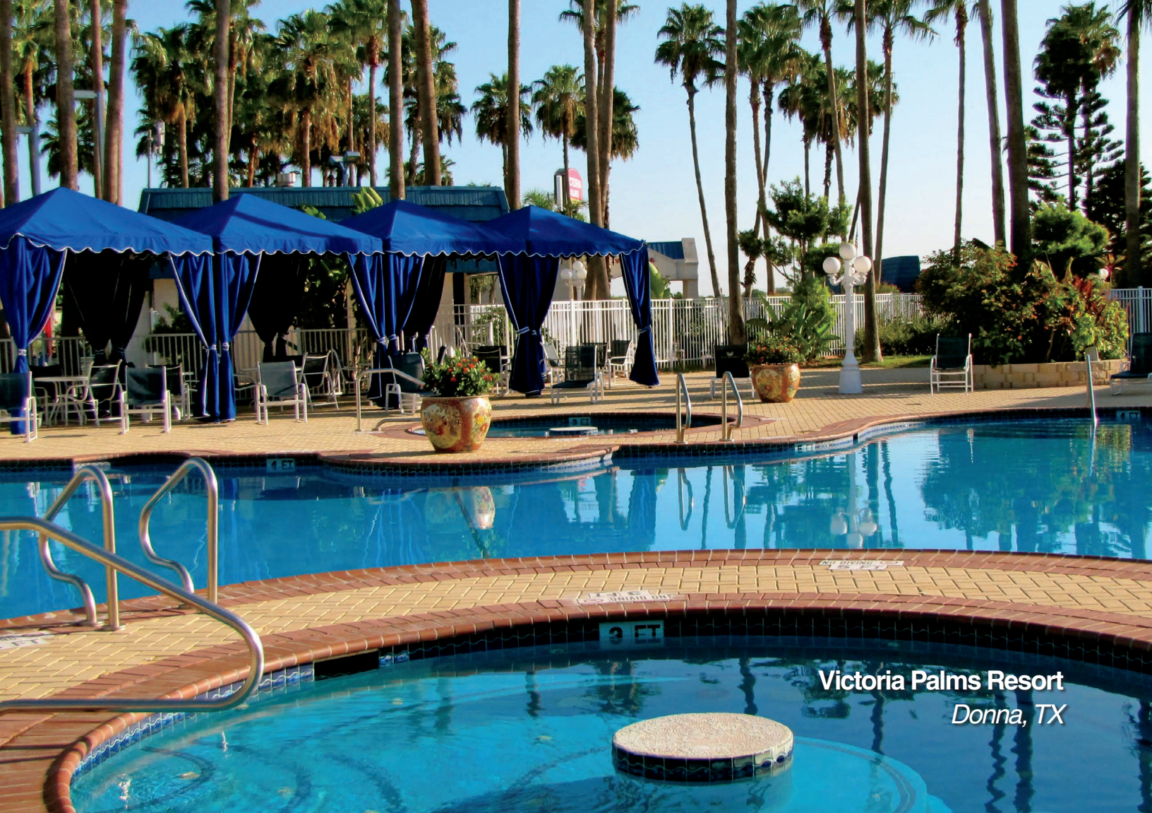
Victoria Palms Resort Donna, TX