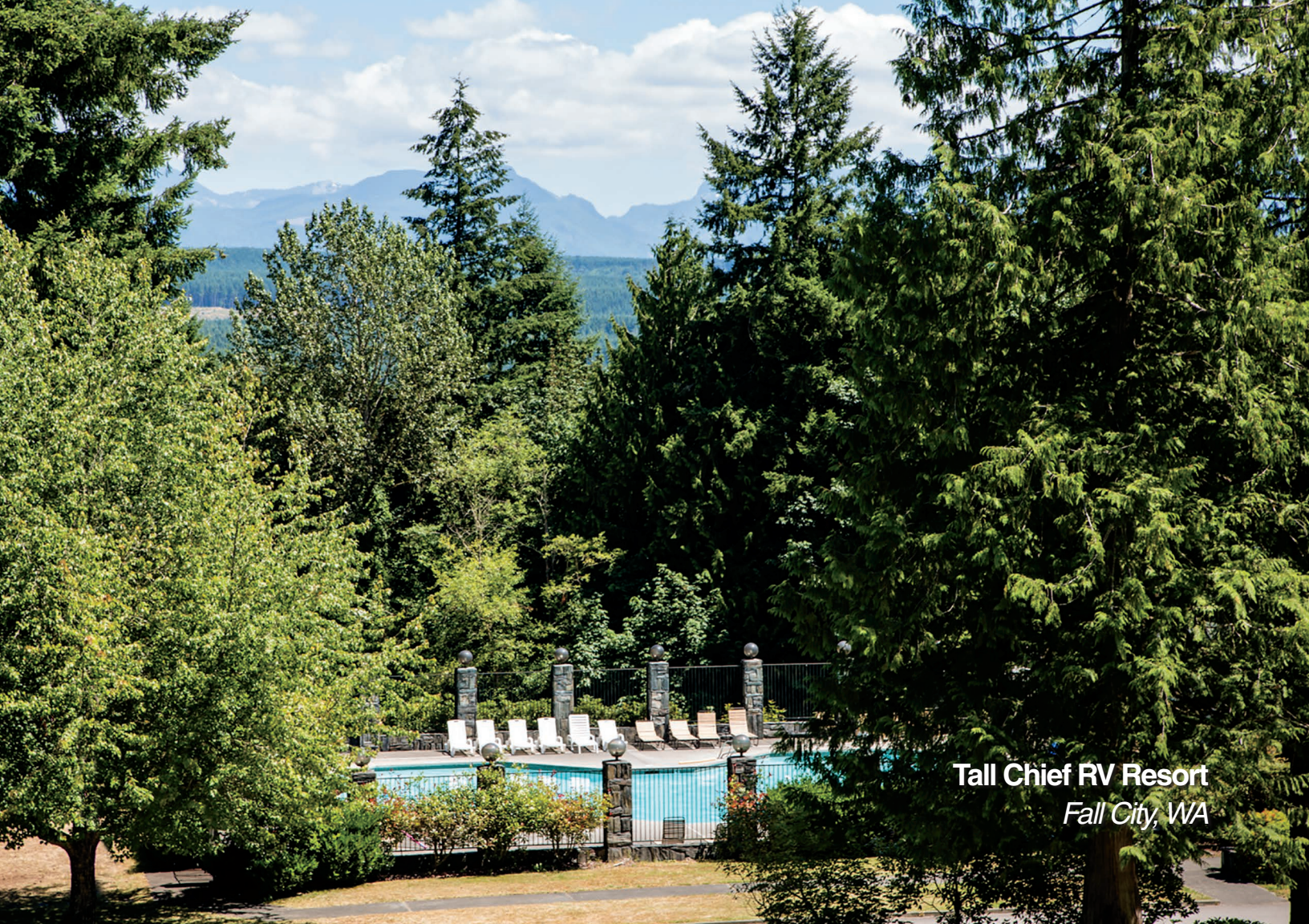
Tall Chief RV Resort Fall City, WA