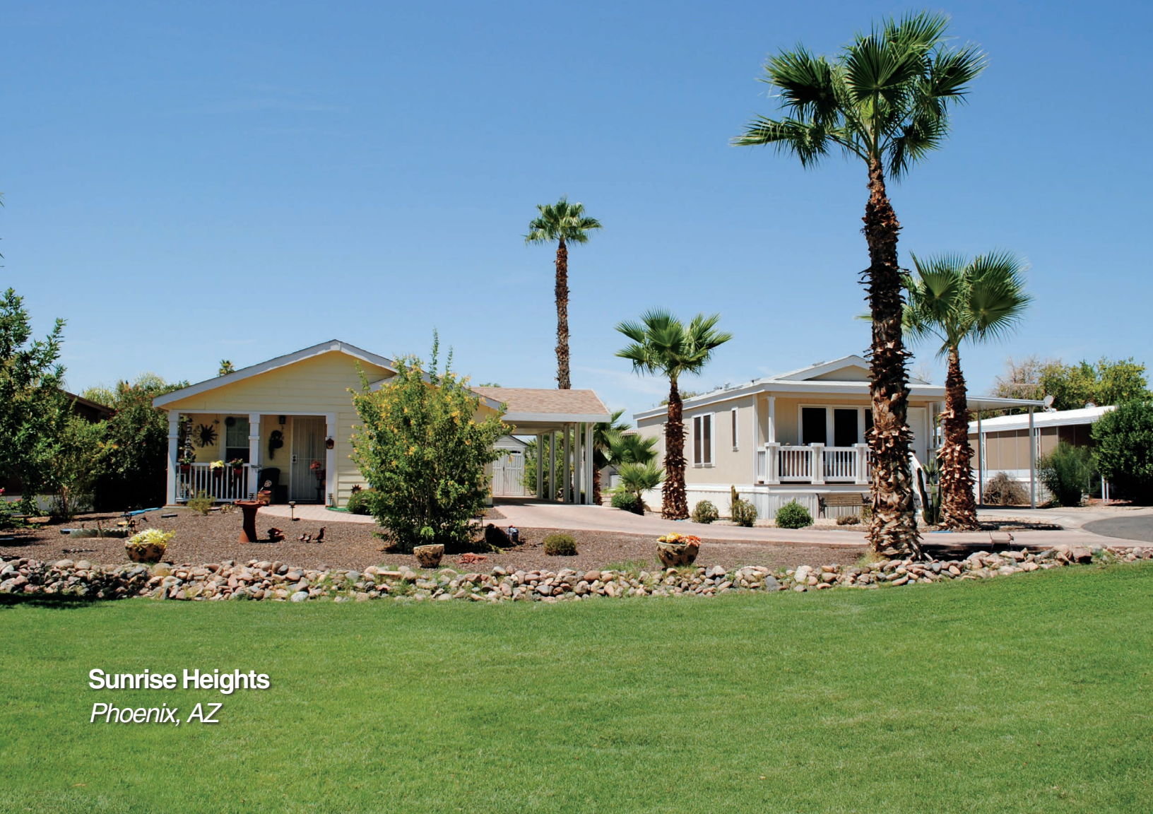
Sunrise Heights Phoenix, AZ