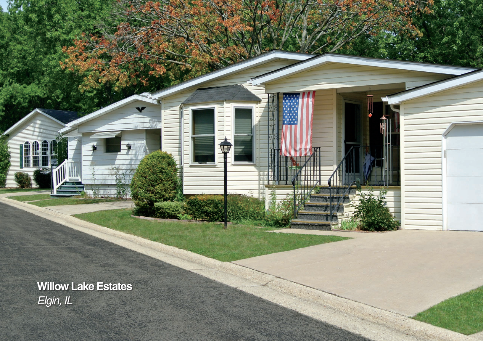
Willow Lake Estates Elgin, IL