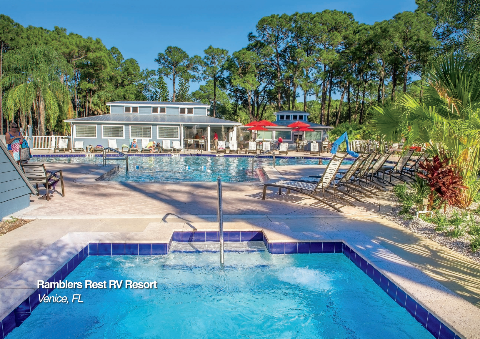
Ramblers Rest RV Resort Venice, FL