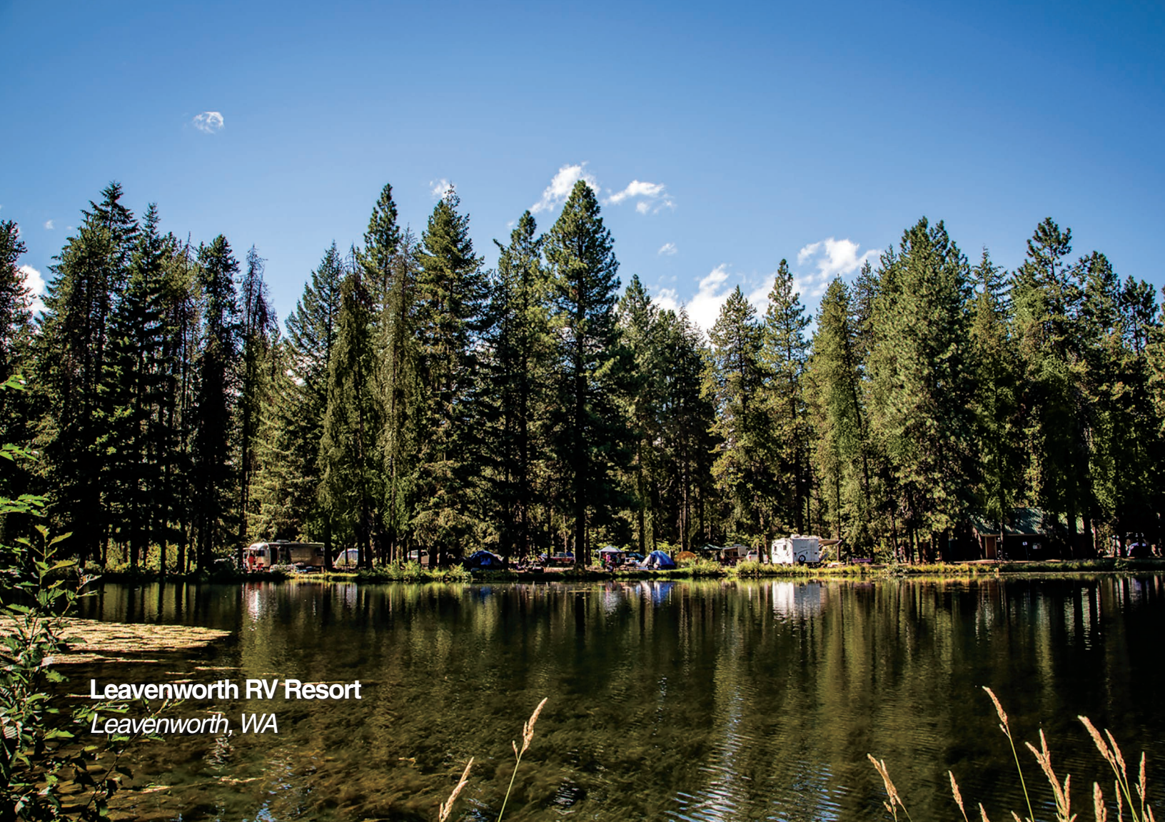
Leavenworth RV Resort Leavenworth, WA