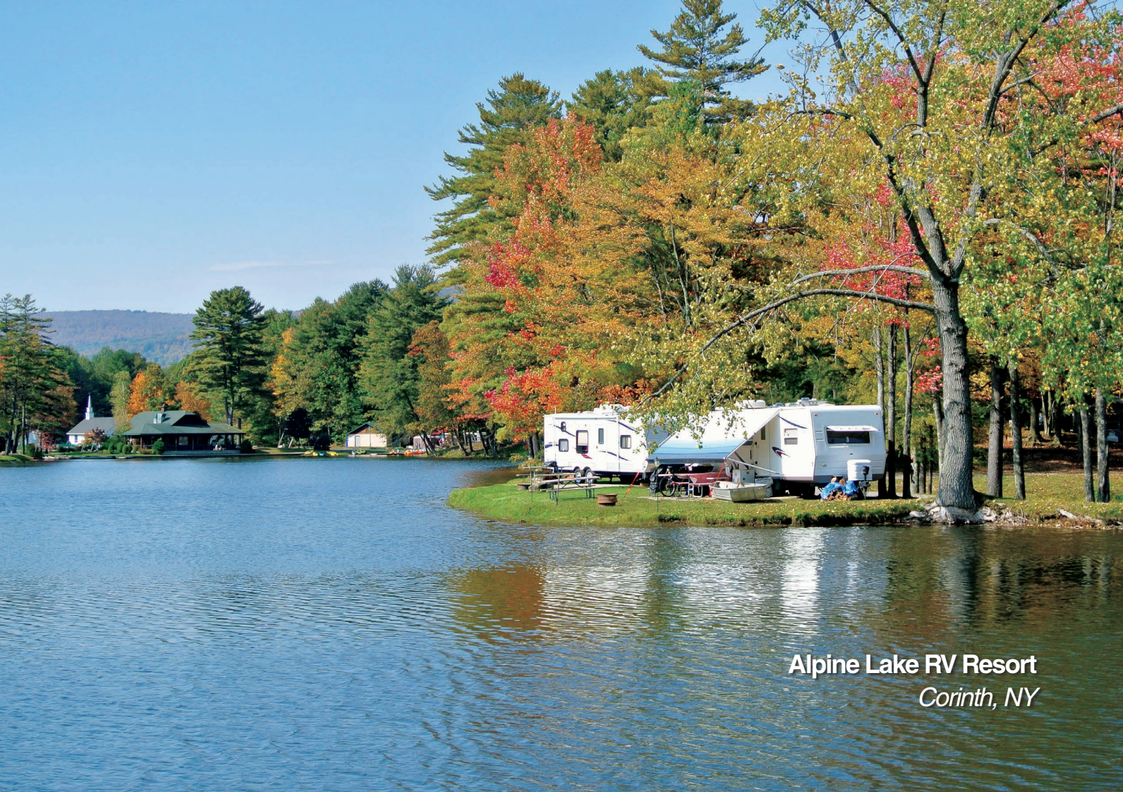
Alpine Lake RV Resort Corinth, NY