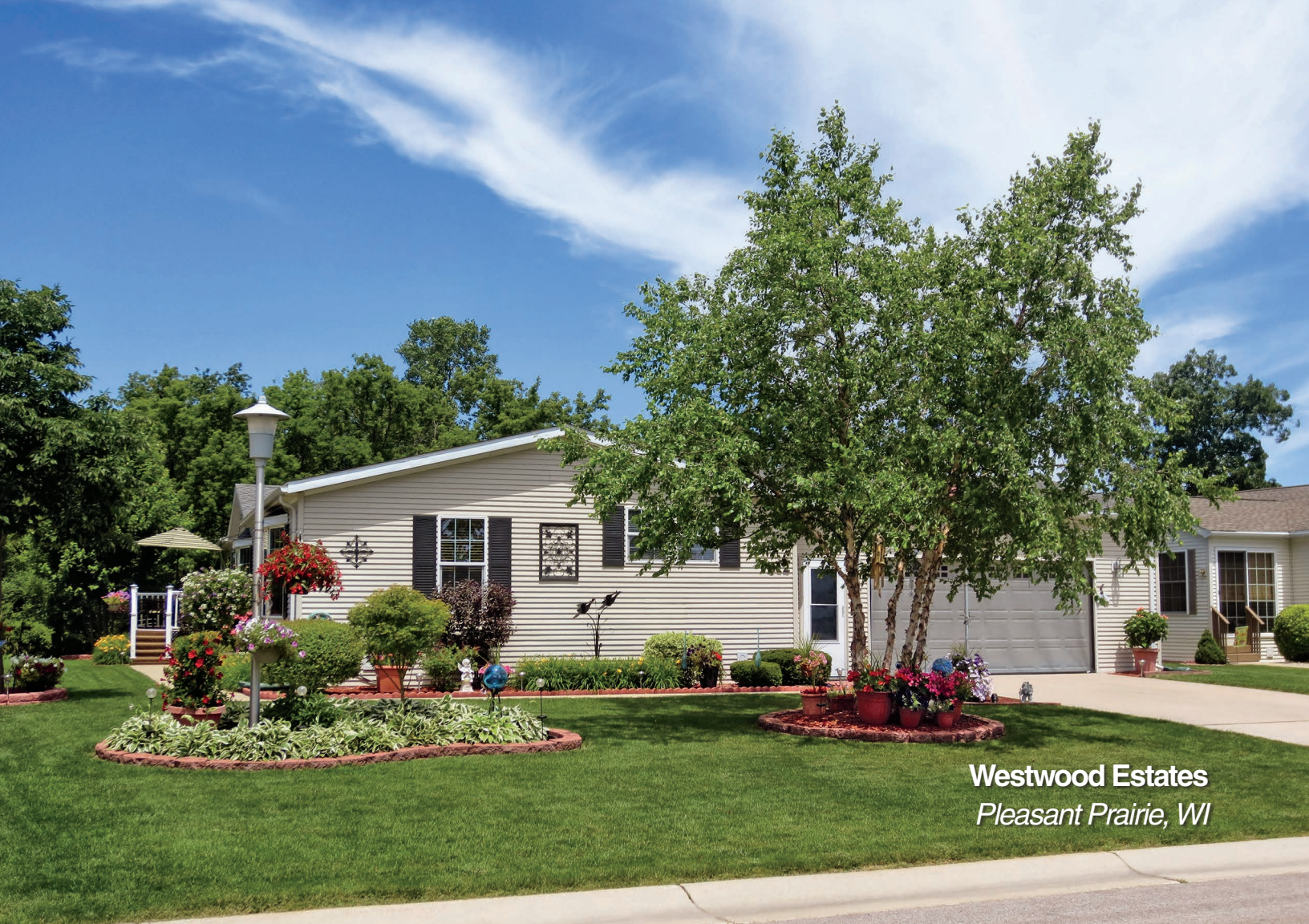
Westwood Estates Pleasant Prairie, WI