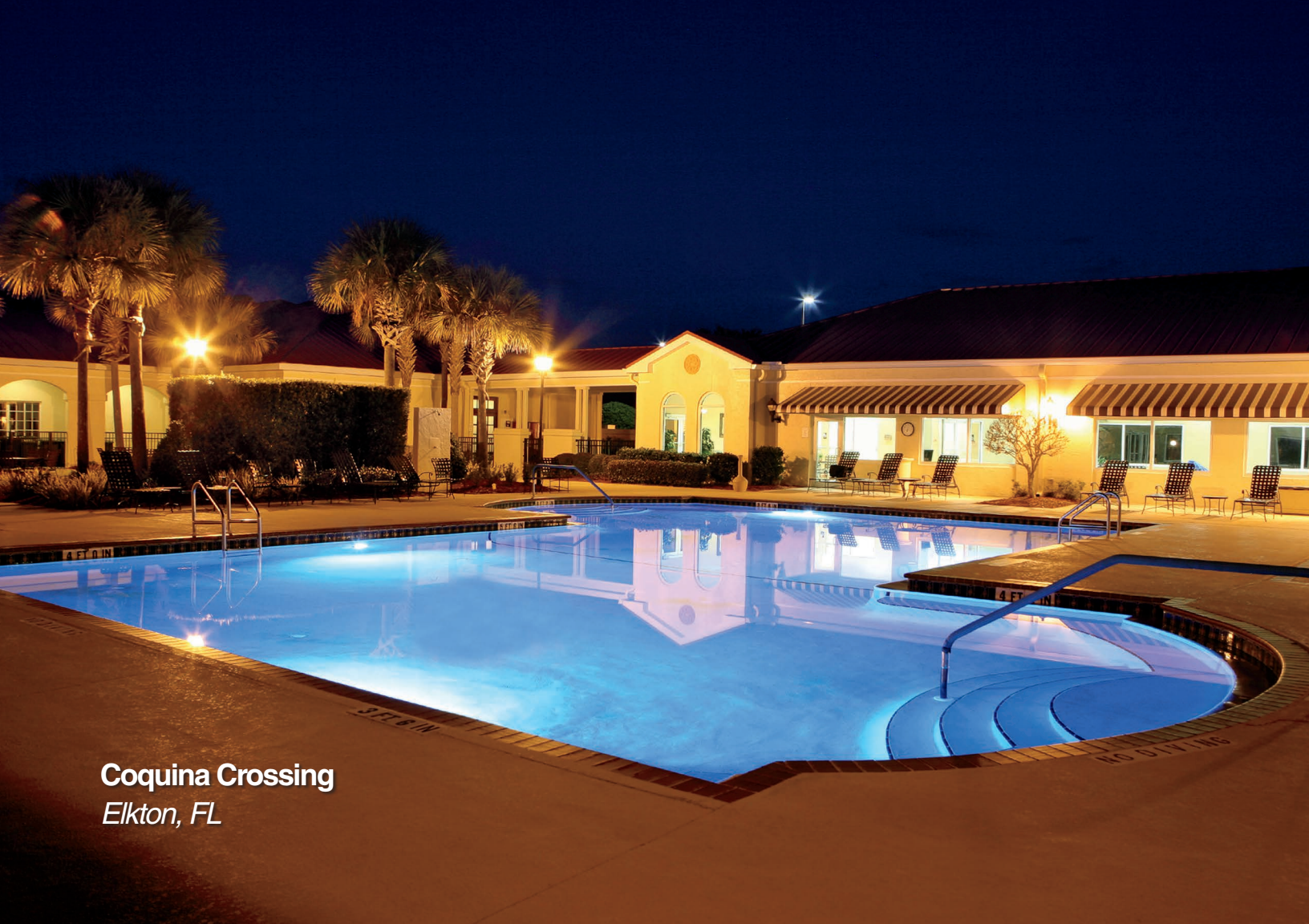
Coquina Crossing Elkton, FL