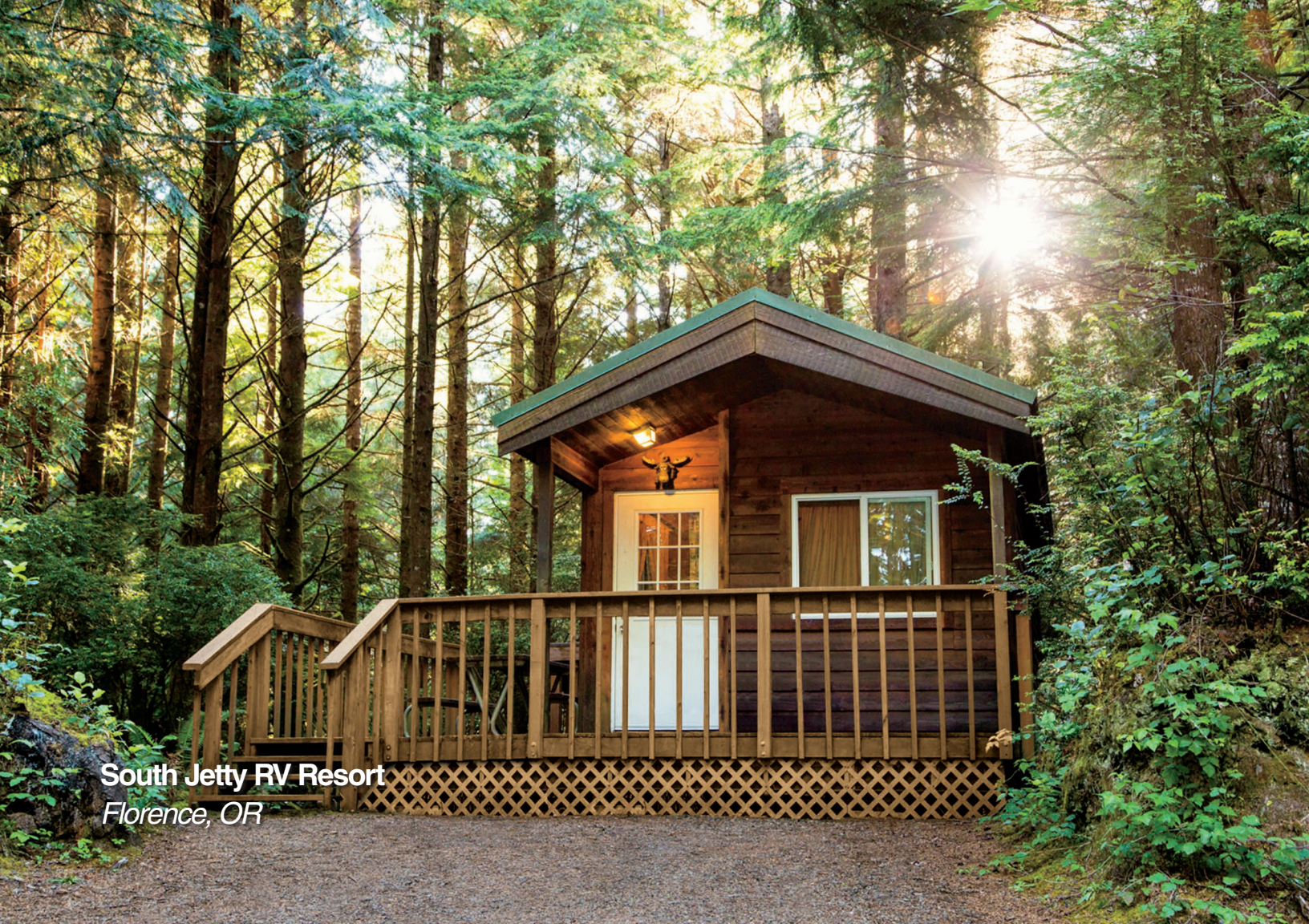
South Jetty RV Resort Florence, OR