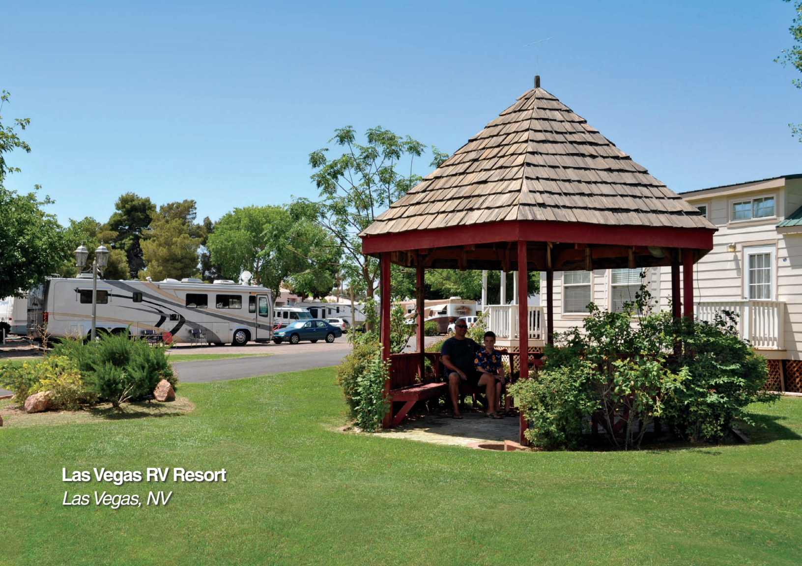
Las Vegas RV Resort Las Vegas, NV