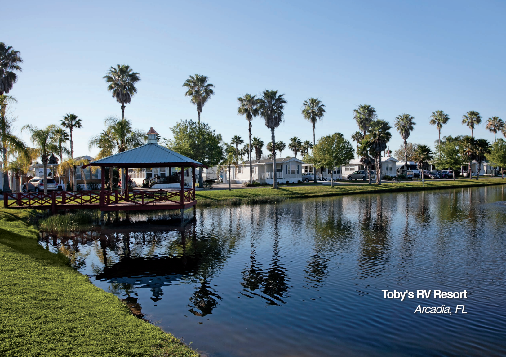
Toby's RV Resort Arcadia, FL