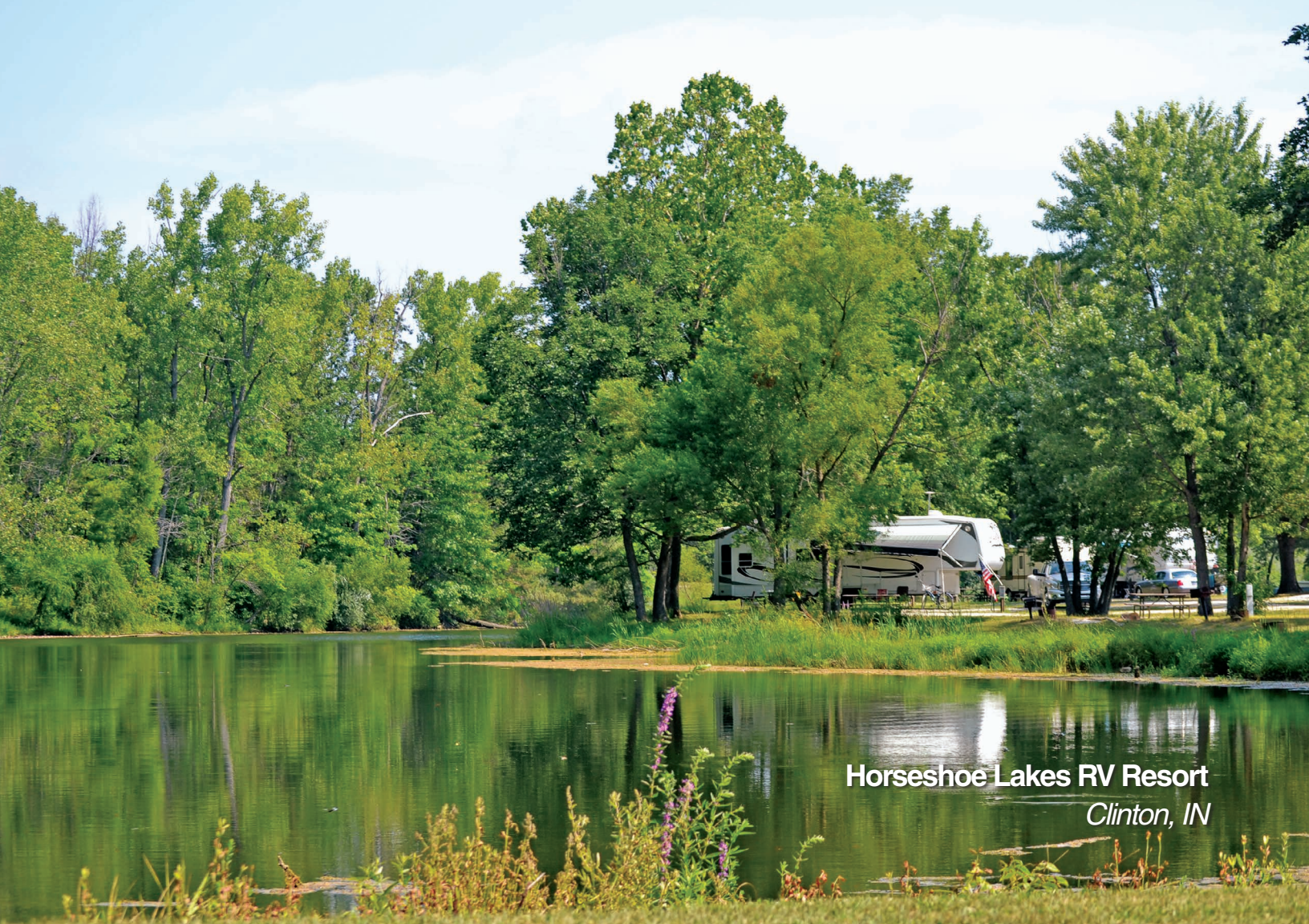
Horseshoe Lakes RV Resort Clinton, IN