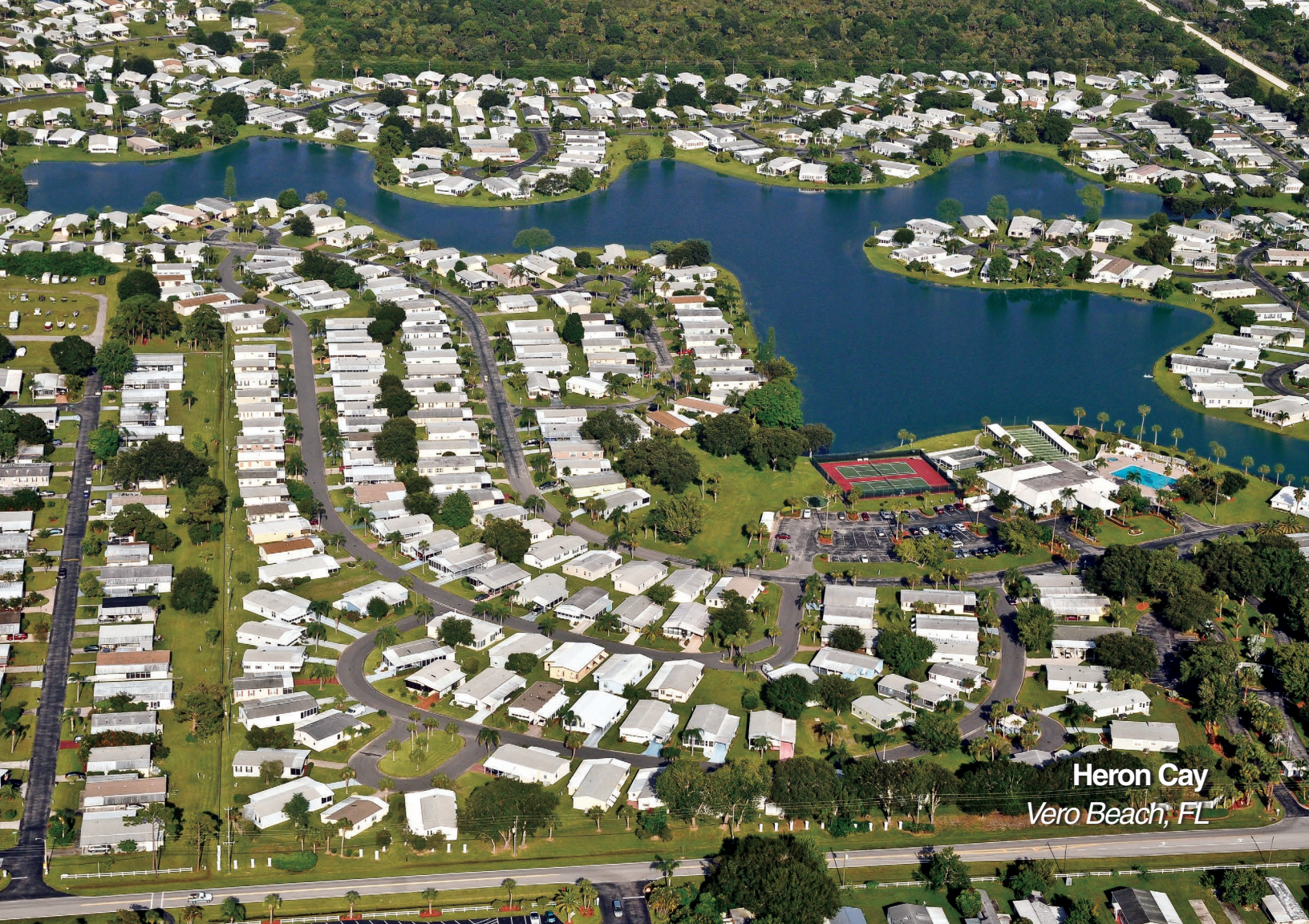
Heron Cay Vero Beach, FL