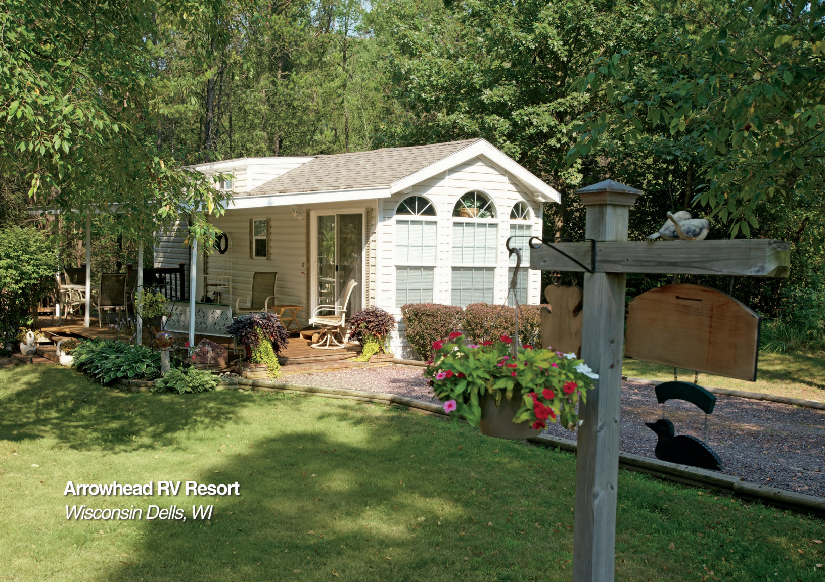
Arrowhead RV Resort Wisconsin Dells, WI